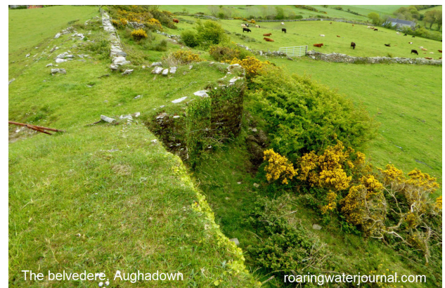
The belvedere, Aughadown

Leaving Minihan's behind you the road forks (10) and you follow the LEFT branch which drops gently downhill and brings you back to the Church at Lisheen and your vehicle.