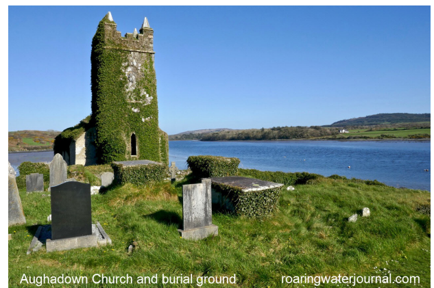
Aughadown Church and burial ground